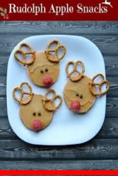
Rudolph Apple Snacks